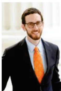
Scott Wiener Senator

A handwritten signature in black ink that reads "Scott Wiener".